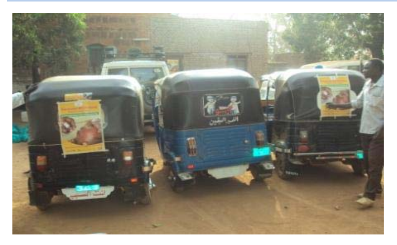
Figure 3: Polio IEC Materials on Bajage during polio campaign